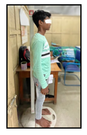
Fig-1: Measurement of height of subject using Stadiometer.

The Fibular length was taken as the distance between the highest points on the head of fibula to the most distal point on the lateral melleolus. The subject, in a standing position, was instructed to keep one leg on a low table. The required landmarks are easier to locate in this position. Cross pieces of the rod compass of the anthropometer were applied to the highest point on the head of fibula and the most distal point on the lateral melleolus to take the measurement (Figure-2).