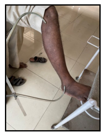
Fig-2: Percutaneous length of fibula is being measured with the help of a spreading caliper.

This measurement was taken on the right side of each individual and the same technique repeated on the left side in the same way in case of each subject. Afterwards the data had been analyzed statistically and results were assessed.